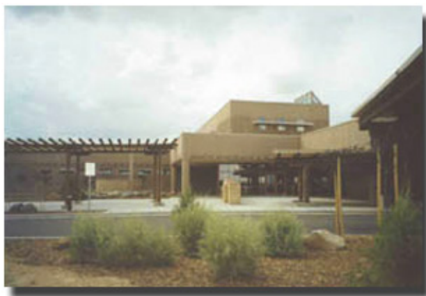
USPHS Indian Health Service-Hopi Healthcare Center

The Center, recently constructed in 2000, is one of the most beautiful rural hospitals in Arizona. Its award-winning building is a metaphor for the typical Hopi village. For instance, it faces southeast and optimizes solar orientation. The architecture design of the Center and surrounding staff housing was developed with input from residents to reflect Hopi artistic and spiritual values. The Center’s massive wooden pillars and natural stone walls whisper hints of ancient plazas and kivas. The wellness of the individual and the family, which are at the core of Hopi belief, are surrounded by a “medicine wheel” of partners and community, quality and safety, staff skills and environment and, as an outcome, funding and finances.