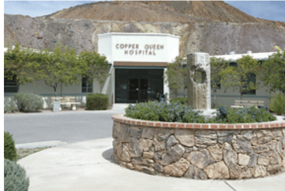
Copper Queen Community Hospital

Copper Queen was awarded CAH-designation on November 1, 2005. The hospital is licensed for 14 acute-care beds, all of which are also licensed as swing beds. Economic necessity caused Copper Queen to close its long-term care facility within the past five years, as government sponsored programs did not cover costs.