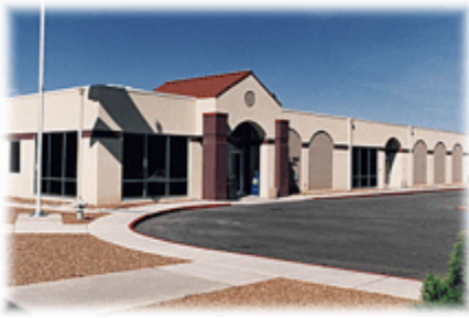
Carondelet Holy Cross Hospital

The Nogales community, where the Carondelet Holy Cross Hospital is located, is in an Arizona Medically Underserved Area, as well as a dental, mental health and primary care Health Professional Shortage Area. The 25-bed, not-for-profit hospital has been a Critical Access Hospital since August 1, 2006.